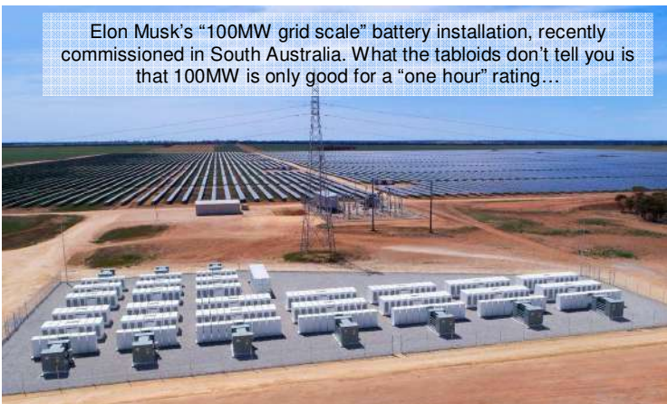
Elon Musk's “100MW grid scale” battery installation, recently commissioned in South Australia. What the tabloids don't tell you is that 100MW is only good for a “one hour” rating...

A recent paper released in December 2019 by AEMO (the Australian Energy Market Operator) titled the “draft integrated system plan” (or ISP), endeavours to create a “road map” for our network into the future for the next twenty years or so. Alarmingly, this document contains glaring errors, omissions and assumptions that will almost certainly put energy reliability at risk—and that's before we even mention the issue of electric cars!