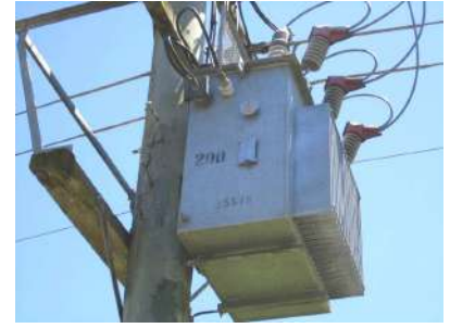
200kW distribution transformer typically feeds 15-30 houses

Before we delve further inside your house, first lets have a look at what's going on outside in the street. Regardless of whether your area is serviced by overhead or underground power, every block or around 60 houses you'll find a distribution transformer which supplies 230/415v from the local 11kV networks. In suburban Australia, these are usually of a capacity around 400kW .