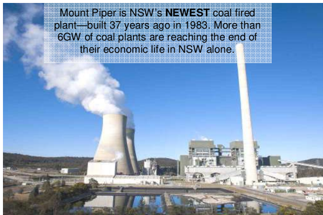
Mount Piper is NSW's NEWEST coal fired plant—built 37 years ago in 1983. More than 6GW of coal plants are reaching the end of their economic life in NSW alone.

In case nobody has noticed, there's already a few problems with the stability of our national electricity grid in Australia. Aside from the problems introduced by ever increasing intermittent power sources ( for the full story read my other paper on “Power networks for Dummies” ) and the fact that over 6,500MW of coal fired generating plant in NSW alone is approaching “end of life” with the newest plant built as long ago as 1983, we also have the compounding issue of ever increasing demand in a country which maintains an immigration rate of over 200,000 per annum and where brand new suburbs and cities are sprouting from fields like grass after a storm.