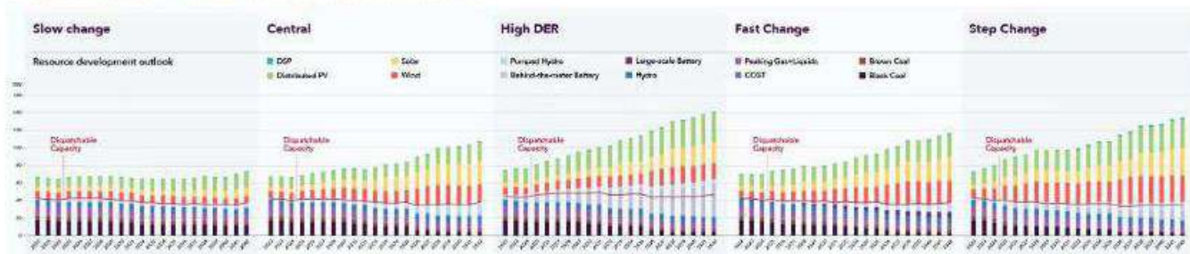
Figure 11 Power system development across five scenarios

That's right! If you don't believe me, here's a graph taken straight from the ISP report showing the proposed overall dispatchable capacity in the East Australian network in coming decades. That's the squiggly line, right in the middle. All five scenarios are shown: