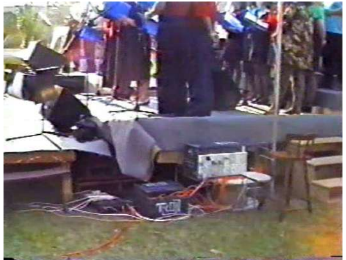
Photo : Emu Plains Carols. The PAMAC 12 channel dimmer rack and it’s associated 3 phase distribution board clearly seen, along with an empty cable drum which held the enormous length of TPS which formed the feed to the gig. Just to the right of the board is the earth stake—driven into the ground and bonded to the Neutral in an attempt to reduce “lazy neutral syndrome” on the long line.

It cost them around $300 bucks each time from memory. It ended when the church split. A significant contingent of them later heading the way of PCLC.