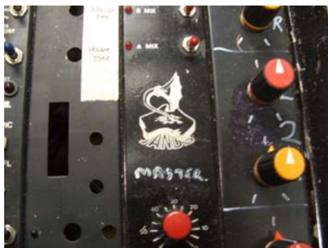
Photo : Jands 26/4/2 with last 8 inputs reconfigured for recording returns From the Tascam 88 1/2” 8 Track.

Finally, with a “real” 8 track facility now at our disposal, “Decision” would get the studio time they deserved. They committed all their original compositions (along with many covers) to tape for their first “album”. All tracked through that same venerable Jands 26/4/2 mixer - which allegedly started it’s journey at the now famous Sunbury 1974 festival in Victoria—nearly 20 years earlier!