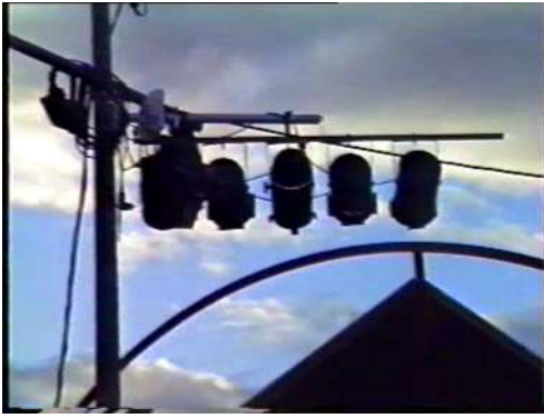
Photo : Penrith Mall Carols—FOH Lighting bars strapped to Streetlight poles

Just about every single night, there was a rain storm immediately before the gig. Of course the lights were completely exposed to the weather and definitely had no kind of IP rating on them. In many cases they were soaked when they were fired up. Fortunately the rig had solid earths throughout.