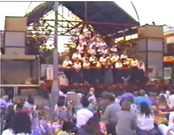
Photo : The Penrith mall Carols ran over 3 nights in the main shopping district—nowadays High St but back in the ‘90s it was closed off as a pedestrian mall.

This gig was sponsored by Penrith CLC in the mid ‘90s when they were still non landed – before they merged with PCFC at Orchard Hills. The audio was again aptly handled by Trevor Jenkins – meaning this was another “ lighting only ” gig.