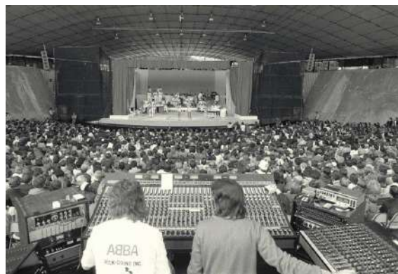
The desk to the right of the legendary Howard Page during an ABBA Concert in 1976 looks like the 26/4/2—however it has since been confirmed as not being the same desk. However this illustrates how this desk began it's life in the earliest days of professional rock sound in Australia. The desk in the photo lacks the EQ mods and has a different channel configuration to the 26/4/2.

2004 – Recovered and preserved without power supply. Tested in 2007 using a bench supply and found to be still in working condition. Stored and still in existence in 2014.