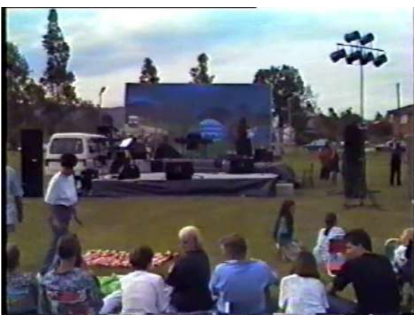
Photo : Emu Plains Carols (at the first site) circa 1995. Still the longest 3 phase cable run we have ever done to date—and at only 2.5mm cable Size!

It kind of illustrates all that's wrong with the “industry” today.. and why we no longer do carols gigs here in the 21 st Century. And we've even had calls from the TAFE since—wondering if we would like to give some of their graduates students a job!