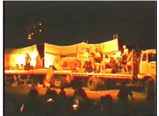
Photo : St Clair Carols 1991. This was the first event we staged ourselves—not aligned with any other group. It then got bigger, and bigger.. And then exploded.

Alas though, this one went sour eventually. One year, a dispute arose when I had to pull the gig mid show for safety due to rain pooling water on the stage. It got worse - the following year when I refused to put an act on who had arrived 20 minutes after the start of the show (!) who had not had any kind of sound check. By this time the Baptist church component had already pulled out of the committee so this had basically become just another paid gig for us.