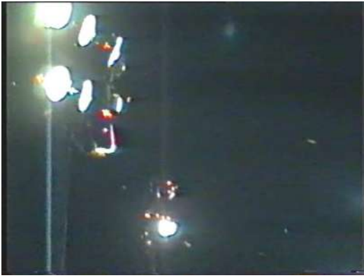
Photo : Lighting trees @ St Clair in the early '90s. Back then these were still the PAMAC push up stands loaded with about 8 cans each, a mix of Par64's and Argaphoto Flood Cans. One needed to have some pretty serious muscles in your arms and hands to push these up when loaded like this!

Alas though, this one went sour eventually. One year, a dispute arose when I had to pull the gig mid show for safety due to rain pooling water on the stage. It got worse - the following year when I refused to put an act on who had arrived 20 minutes after the start of the show (!) who had not had any kind of sound check. By this time the Baptist church component had already pulled out of the committee so this had basically become just another paid gig for us.