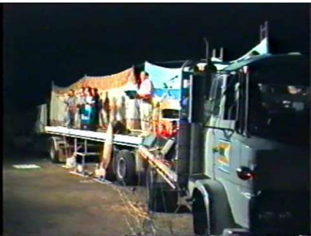
Photo : St Clair Carols—Circa 1991. Two trucks back to back, in a retention basin field on Banks Drive, St Clair.

It was a long haul gig. Typically a 16 hour day end to end for four guys with a gross of around $1500 in 1995 dollars. It ended suddenly when the Band club had a haemorrhage in the management dept. The girl who arranged the gig each year walked out - and that was that. Invariably the park must have been too far from the pokies.