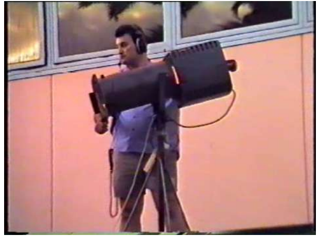
Photo : Penrith Mall Carols—Stand Patt 793 follow spot on the roof of an adjacent Shop awning.

Just about every single night, there was a rain storm immediately before the gig. Of course the lights were completely exposed to the weather and definitely had no kind of IP rating on them. In many cases they were soaked when they were fired up. Fortunately the rig had solid earths throughout.