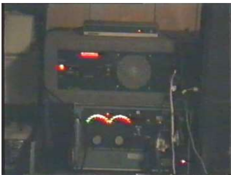
Photo : Amplification available in and around 1990 at Rooty Hill - both home built "Electronics Australia" Twin 300w units. The lower one still exists and works today.

"The Rooty Hill" is an isolated 20 acres of grass in the green belt bounded by Eastern Rd and the M7, across from what is now Blacktown Sports Park. Right away it's gentle but solid grass slopes presented many a challenge just getting vehicles up there—especially when wet.