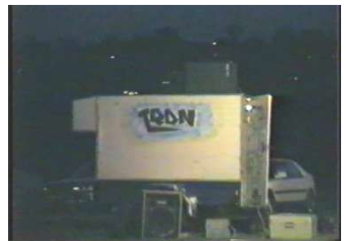
Photo : Rooty Hill carols, early 1990's. The PAMAC trailer (affectionately known back then as the "TRON" Trailer for obvious reasons) doubles as a speaker platform with a Bose 802 and Hohner KB180 (2x12") for FOH. The "Useless" Etone 15" sub sits on the grass in front.

By 1998 - the organisers had managed to upgrade the stage to a Tautliner truck which itself present more than a few challenges when trying to level it on the gentle grassy slope.