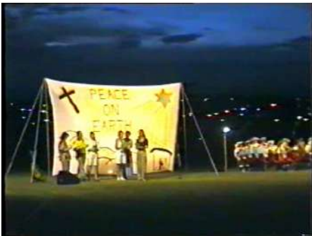
Photo : Rooty Hill Carols—early 1990's. No stage, No power, Brass band. Behind—the ubiquitous storm brews in the west!

Many other components of the system were also adapted to big budget film use during the '90s.