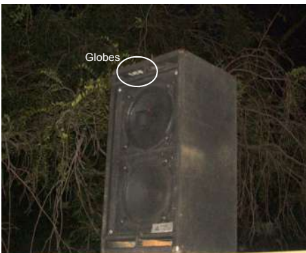
Photo : The venerable F500 in use at Kurrajong. In the top left side port can be seen a collection of 12v globes—connected in series with the Peavey 1" throat coaxial horn to protect it against overload. These globes would glow regularly when the speakers were driven to their limit.

This gig came our way in the late '90s. It was arranged by a conglomeration of the local Baptist and Anglican churches. They had previously gone through other production firms - but were unhappy with the skill level of their operators and their gear.