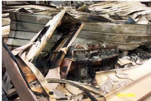
Photo : Tragic scene of what was left of Barnabas Studios after the 2003 Canberra Bushfires. The rear of the Tascam 16/8 can clearly be seen. Underneath, a blob of molten aluminium marks what was left of the amplifier which started it all waaay back in 1979—the Hans Overeem Twin 100. Hmm.. This COULD have been the Jands!

With new accommodation in Canberra now arranged, Barnabas Studios once again stepped in and put their hand up. The old PCFC console underwent "restorative" work before being permanently housed there in 1998. It went on to record many Canberra based bands and albums before the mixer, the original 1973 Hans Overeem amplifier and other much loved heritage gear was lost. The entire facility was tragically destroyed in the Canberra bushfires in January 2003. Sadly, the original master 8 track "Decision" tapes were also lost in this disaster although 2 track digital masters thankfully remain.